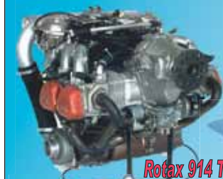
Rotax 914 Turbo