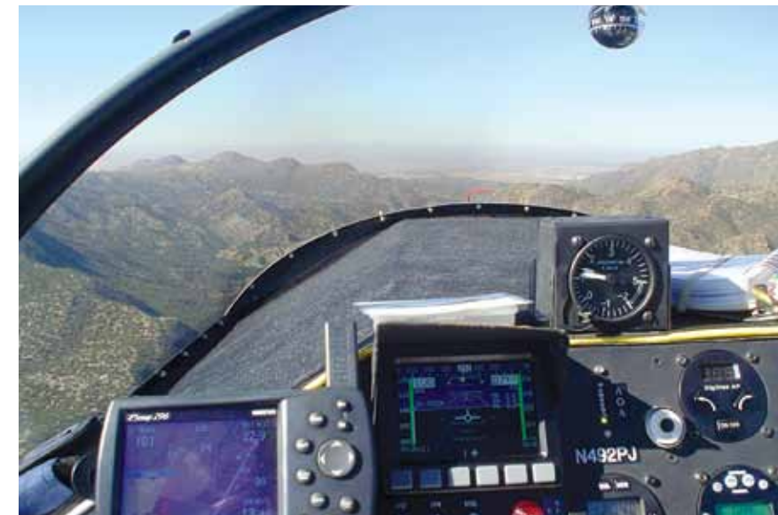
Simon's GPS was essential; crossing the pass into Albuquerque, it kept him away from Class-C airspace, the international airport, and temporary flight restrictions for a balloon event.

Remember, I wasn't flying a Cessna 182. I was flying a 700-pound LSA