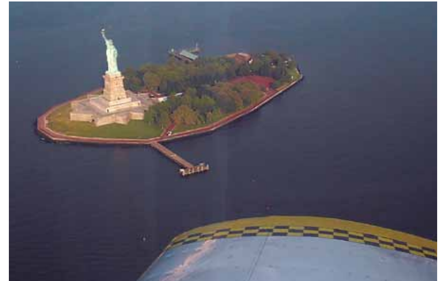
Flying the New York-Hudson River corridor was the highlight of his adventures, Simon says, with its close-up views of Manhattan, Ellis Island, and the Statue of Liberty.

For all of the flights, I averaged a fuel burn of slightly over 4 gallons per hour at 100 mph, in spite of flying heavy at low altitudes. I never flew higher than 1,000 feet above ground level (AGL); I could have had better performance in a lighter airplane, flying at higher altitudes, leaning the engine, and even finding