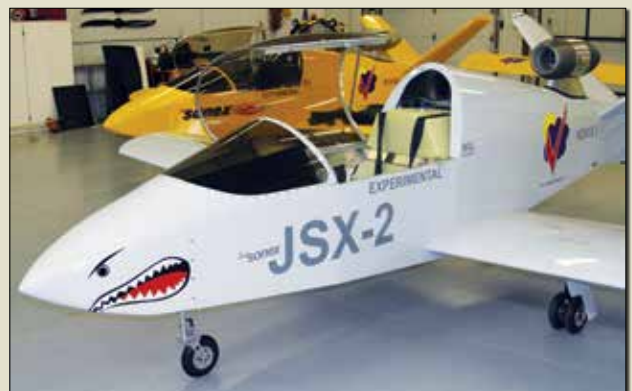
The SubSonex kit includes the PBS TJ-100 turbojet engine, retractable gear, and a BRS full-aircraft parachute recovery system.