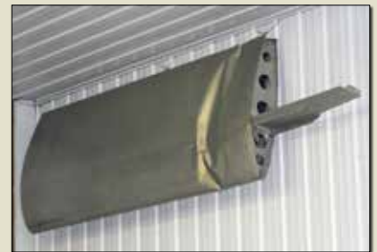
Trophies of static load testing adorn the prototype shop wall. This Sonex wing failed well above design loads.