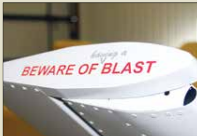
Sonex prototype employees are not above having a little fun, along with their emphasis on safety.