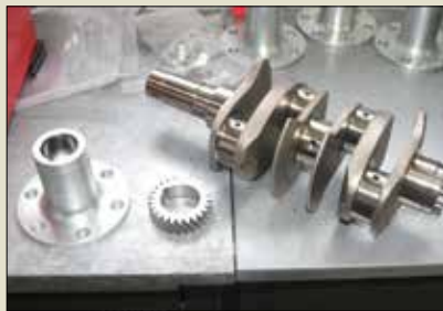
The AeroVee engine is available as a kit, and the crankshaft can come with the prop flange pre-assembled or in a DIY package (shown here).