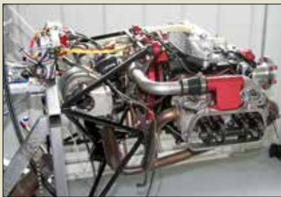
The new turbocharger adds horsepower to the AeroVee engine in a clean, spacious installation. Shown here in a test stand, it is currently flying in a factory Sonex.

In the engine shop, Joe Norris and others were busy testing a new turbocharger for the AeroVee engine that can be retrofitted into