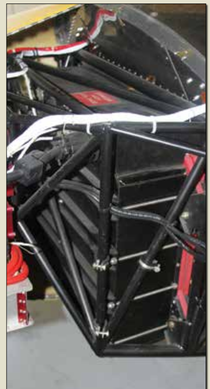
The battery pack for the electric Sonex is currently too expensive for the market—but technology is advancing quickly, and we expect this project might come back off the shelf soon.