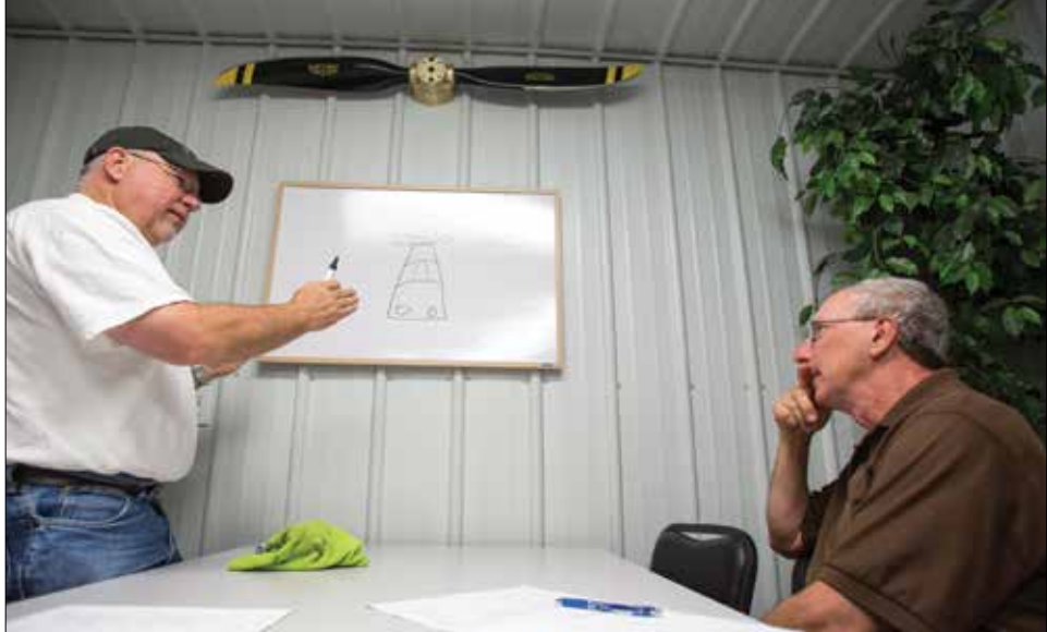
Spending time in the classroom saves time in flight. The T-Flight program at Sonex includes two hours of ground school to talk about unique aspects of the Sonex line.

Pilots flying in to do a T-Flight program can taxi right to Sonex's front door—or better yet, take advantage of special deals