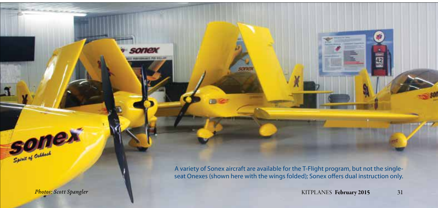
A variety of Sonex aircraft are available for the T-Flight program, but not the single-seat Onexes (shown here with the wings folded); Sonex offers dual instruction only.

Most Experimental airplanes fly well, and this is true of the Sonex airframes—yet it is important for new pilots to understand the unique characteristics of handling, sight pictures, and operating techniques. These can be discovered by good pilots on their own—but it is