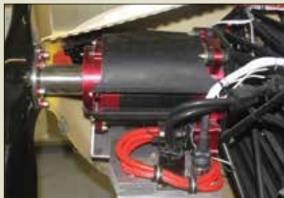
Although battery packs are large, electric motors are small, and the next incarnation of the electric Sonex will probably sport an even lighter unit.