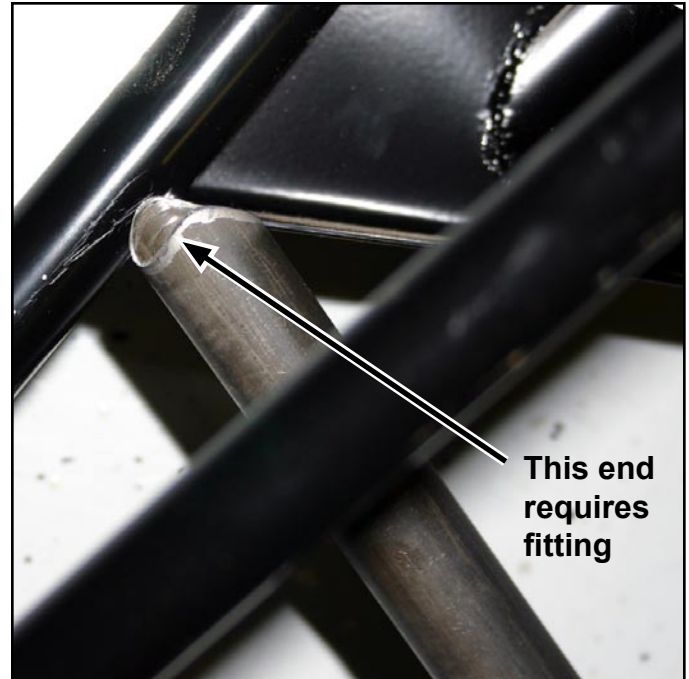
This photo shows the end of the tube which interfaces with the triangular nose gear gusset. This end of the tube must be shortened until it fits in place against the triangular gusset and tube.