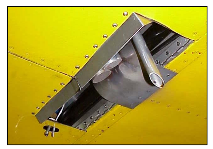
This photo shows the standard outlet for a 2-into-1 exhaust fitted to a cowl without pre-molded tunnels. The cut-out measures 4" x 12.5". No additional cowl outlets are needed for cooling air. The small tube in this photo is the oil breather.

A stainless steel deflector may be added to the bottom of the fuselage floor to guide and deflect the exhaust gases.