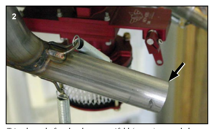
Trim the end of each exhaust manifold (arrow) as needed to get the exhaust extensions to exit the cowl in the desired location.

2. Slide an extension pipe onto each manifold. It may be necessary to shorten the length of the exhaust manifold if the extensions interfere with the firewall. Do not shorten the expanded portion of the extension pipes.